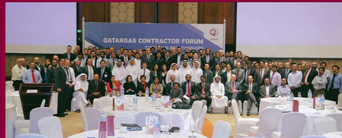
Qatargas and Contractor representatives at the recently held Qatargas Contractor Forum.