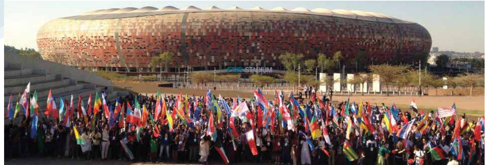
"One Young World" Summit opening, Johannesburg.