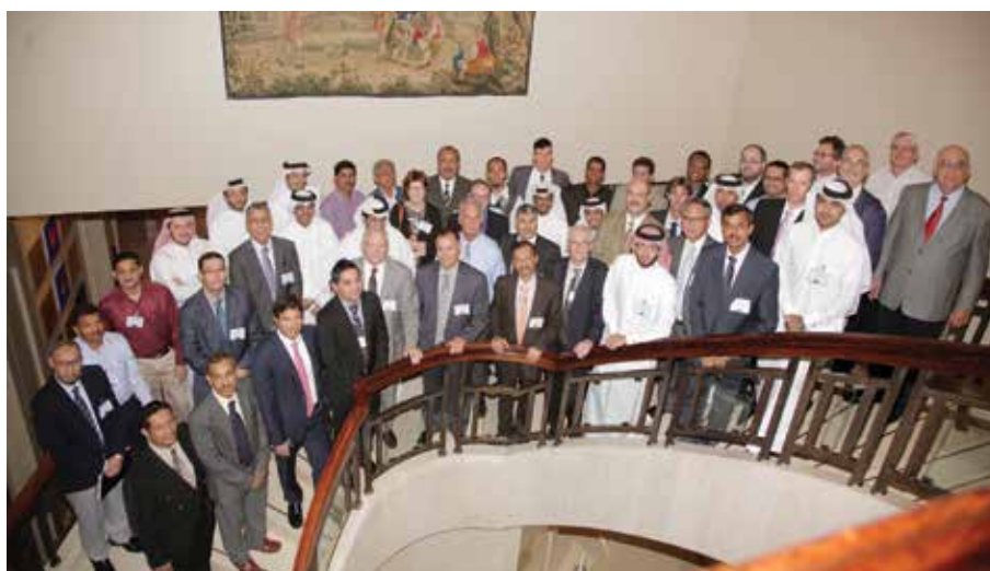
Visitors from ExxonMobil to the Global Environment Event hosted by Qatargas.