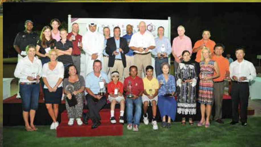
Competitors and winners at the 15th Qatargas Open Golf Tournament