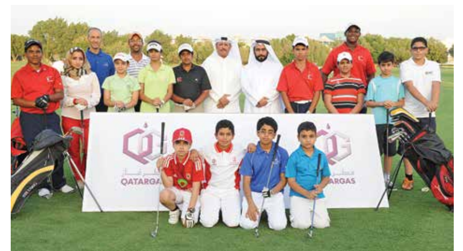
Junior golfers on the QGA Junior Golf Programme.