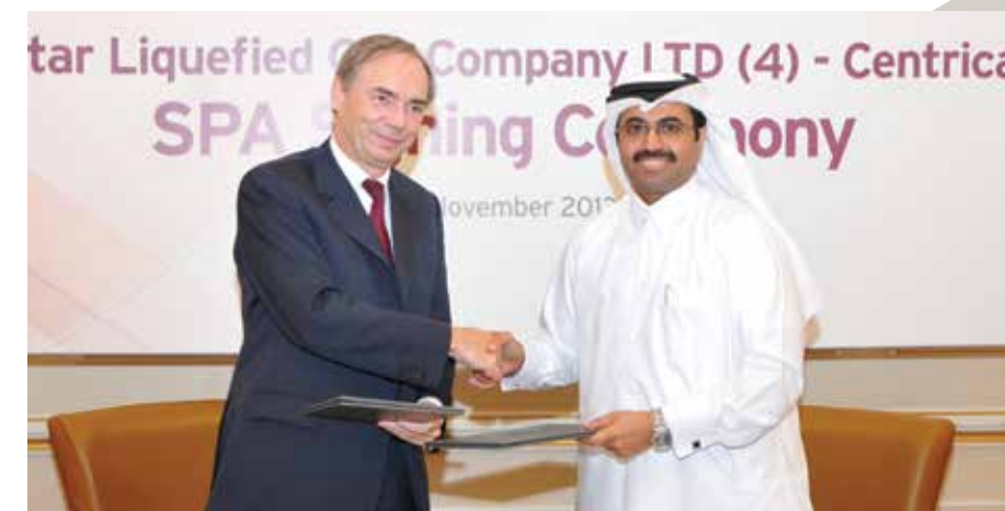
His Excellency Dr. Mohammed Bin Saleh Al-Sada, Minister of Energy & Industry and Chairman of the Board of Directors of Qatargas, and Mr. Sam Laidlaw, CEO of Centrica at the signing ceremony.

At the ceremony, His Excellency Dr. Mohammed Bin Saleh Al-Sada welcomed the new SPA as "another