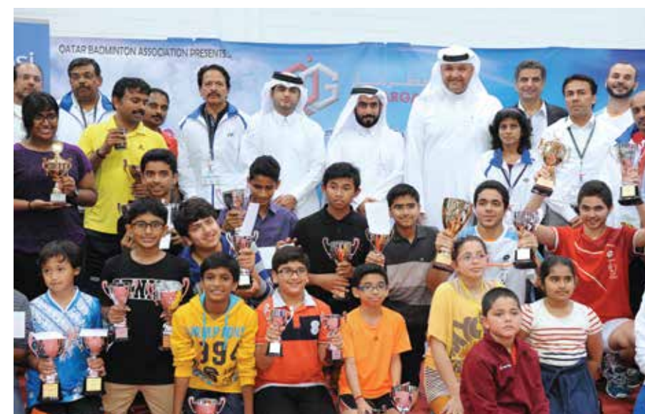
Qatargas and Qatar Badminton Association officials with the winners and runners up.