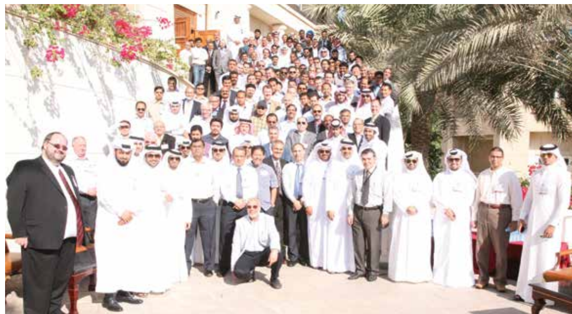
Delegates at the recent Engineering Forum held at the Four Seasons Hotel in Doha.