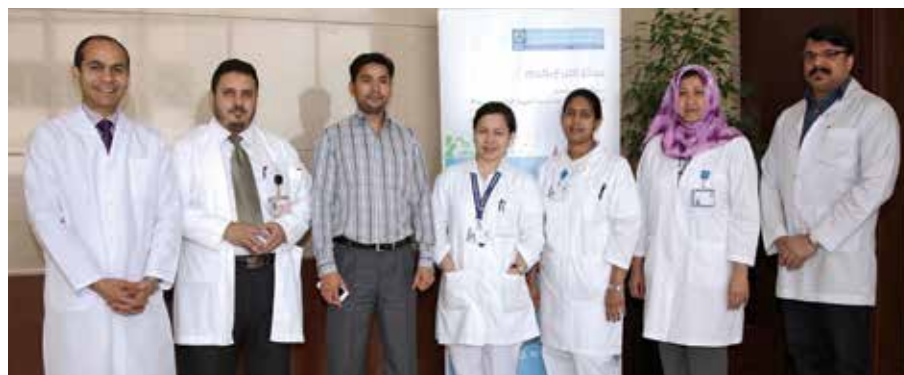
HMC's team of medical professionals, assisted by Qatargas Medical Center personnel.

“Qatargas has been organising blood donation campaigns at its premises over the past 13 years.”