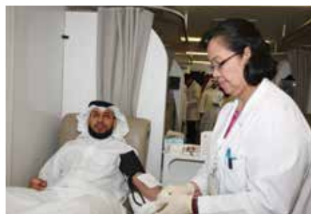
A Qatargas employee giving blood at Qatargas' recent Blood Donation Day.

The Company organizes four blood donation campaigns every year: two