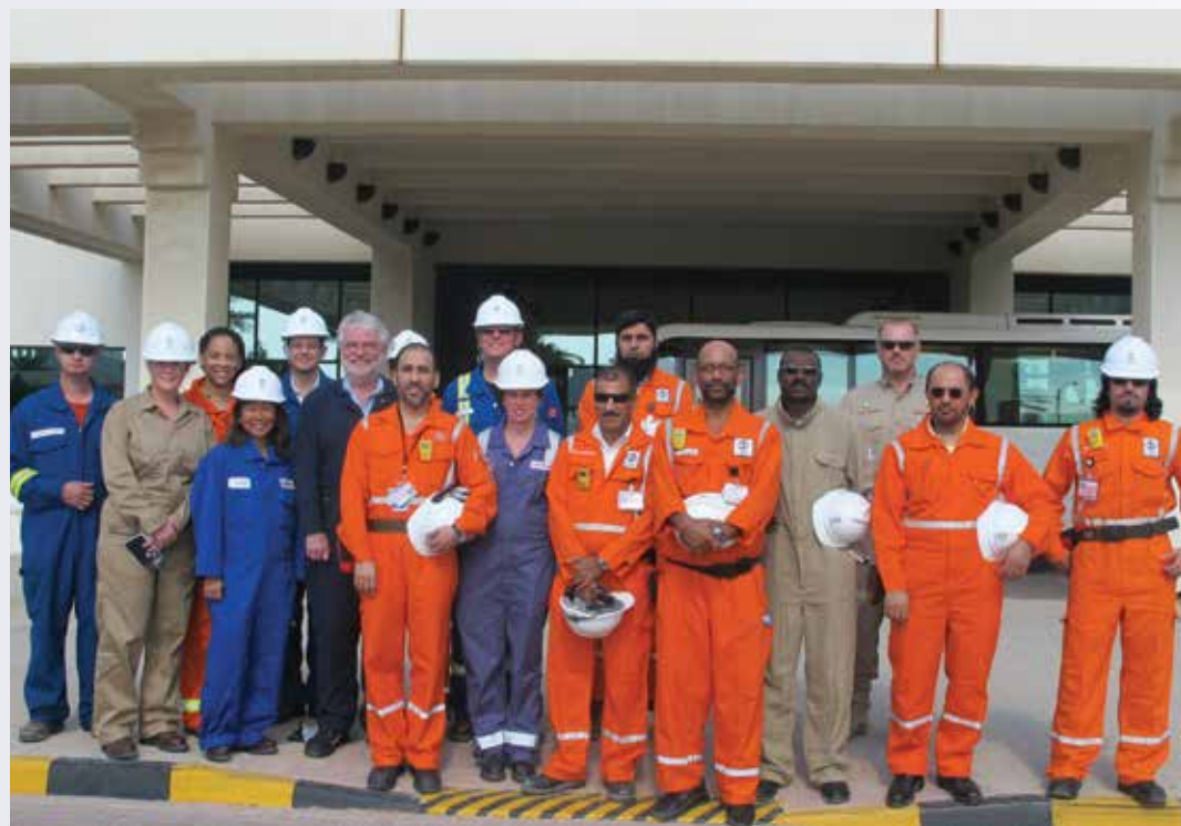
A visit from ExxonMobil to the Global Environment Event hosted by Qatargas.