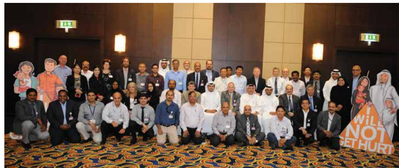
Delegates at the second Qatargas Contractors' Safety Forum held at the Renaissance Hotel, Doha.

Qatargas recently hosted its second Contractors' Safety Forum for 2013 at the Renaissance Hotel in Doha, reinforcing the commitment to collaboration with contractors on safety.