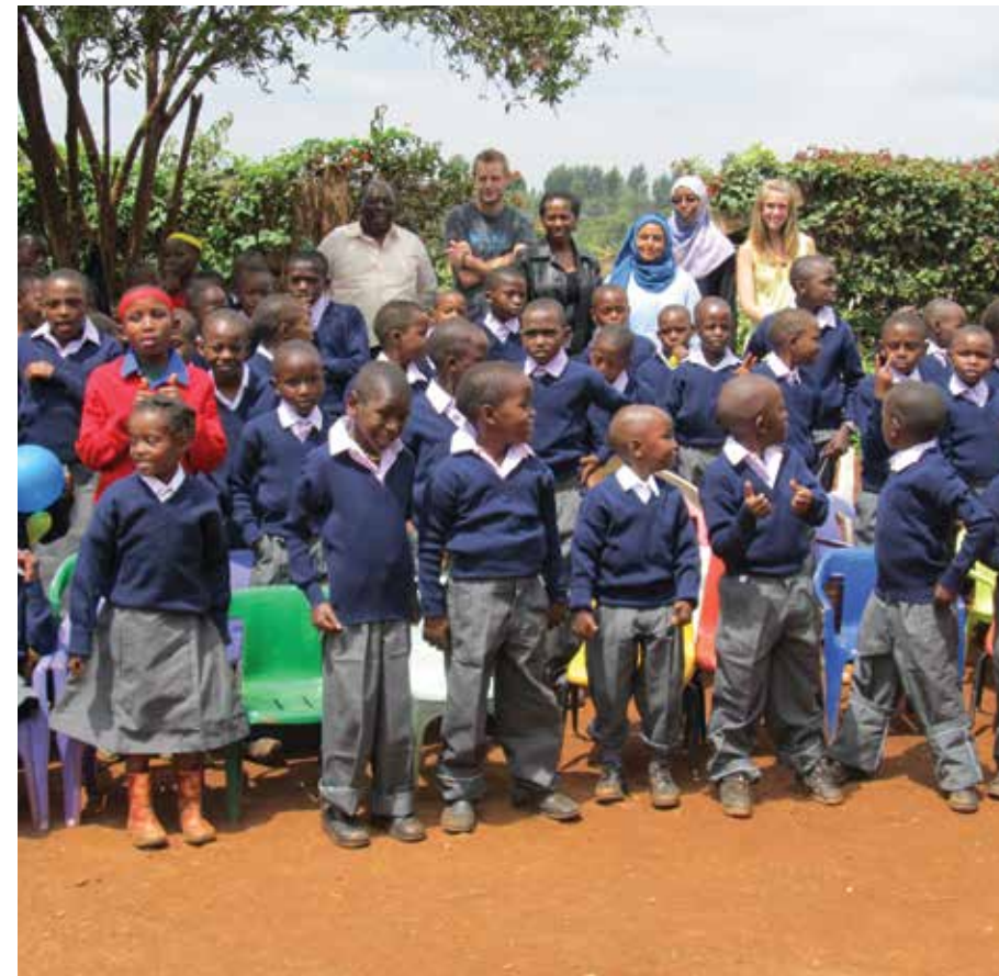
Volunteering at a school and orphanage in Kenya.

six years has definitely contributed to my personal development and building professionalism. It was a privilege to start my first full-time job with a multinational team with solid experience in their respective fields. A team who are willing to share and