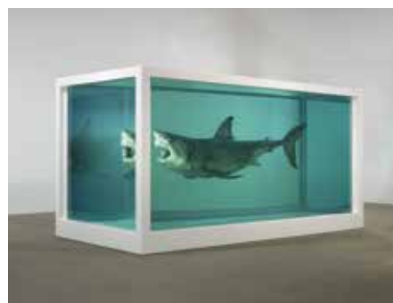
The Immortal, 1997-2005.

Relics: Damien Hirst Exhibition until 22 nd January 2014, AL RIWAQ Doha Exhibition Space, the artist's first retrospective solo exhibition in the Middle East.