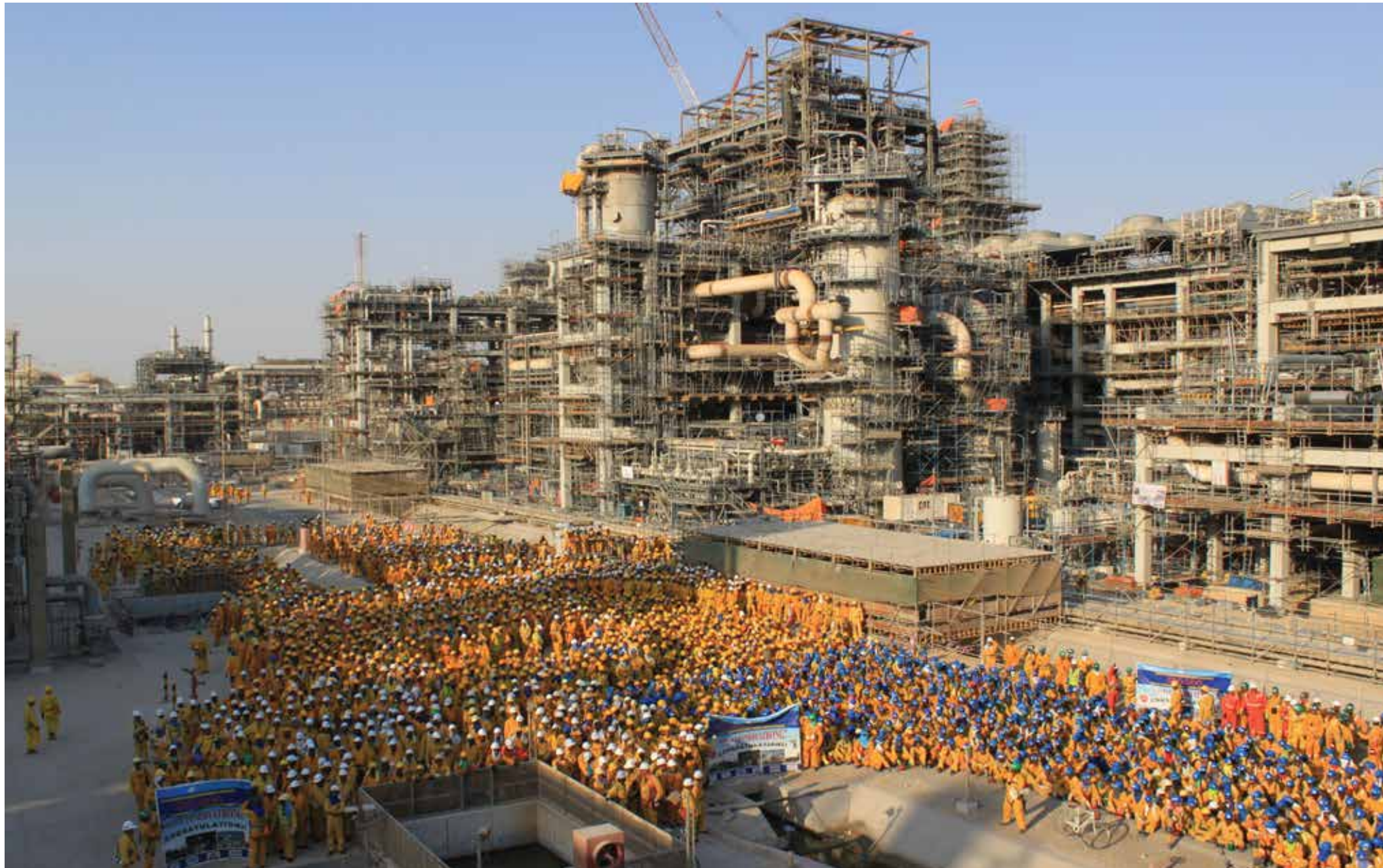
Qatargas and PMP contractor employees marking the 500,000 STOP card safety milestone.